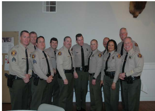
Police honorees at Appreciation Night